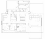
Line House Line House utilizes a unique building system which is a refinement of a "standard" 200' (Standard Industrial Panels). It is 100 percent deep green, airtight, energy and well insulated, making this house the first to be certified according to the Swedish government's strict regulations on passive housing. Combined with highly efficient windows and foundations, the house does not require any active heating, even when the temperature drops to -30 degrees Celsius. The house is divided into a children's and an adult zone, which are connected through a common office zone passage. The roof is raised above the central areas adding and defining a feeling of space. The master bedrooms is linked with the living area by the floor to roof door. The raised roof then continues on the outside of the house, creating an overhang over the terrace. 01 Kitchen and dining area | 02 Living area | 03 Side view | 04 Corner view | 05 Terrace | 06 Floor plan